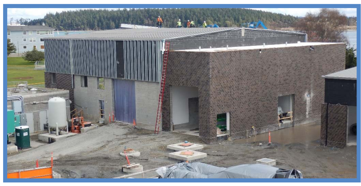
Solids dried in this building will be trucked off site to use as fertilizer for golf courses, farms, community gardens, and more!

5 Solids building: Hot air is used to dry the leftover solid waste as it travels across a conveyor belt in the biosolids drier machine.