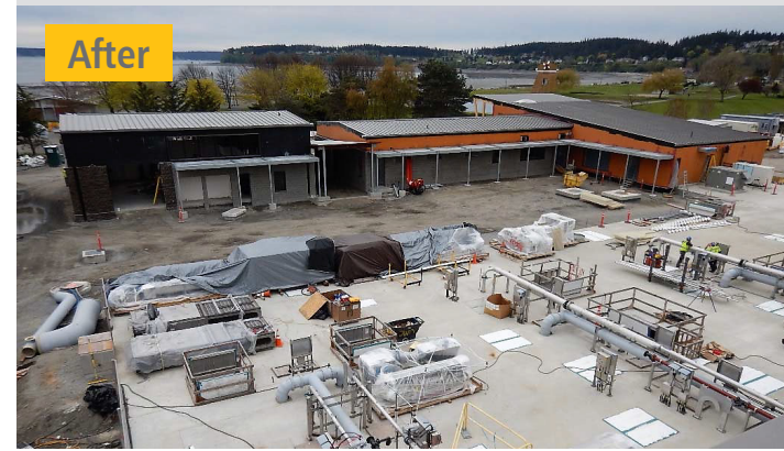
Look how far we've come! Before and after view of the maintenance and administration buildings at the new Oak Harbor Clean Water Facility.