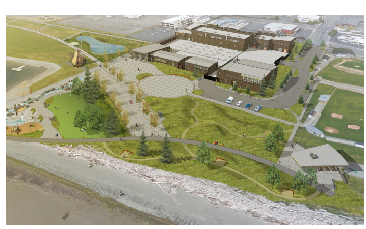
A new splash park, public plaza, kitchen, and other community spaces are coming to Windjammer Park summer 2019.